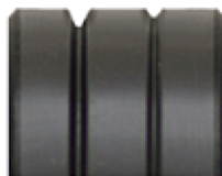
V Groove Rollers For Solid Wires

COMPLETE WIRE FEEDER ROLLS RANGE AVAILABLE UPON REQUEST