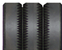
FCW Groove Rollers For Flux Cored Wires