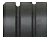
U Groove Rollers For Soft Wires